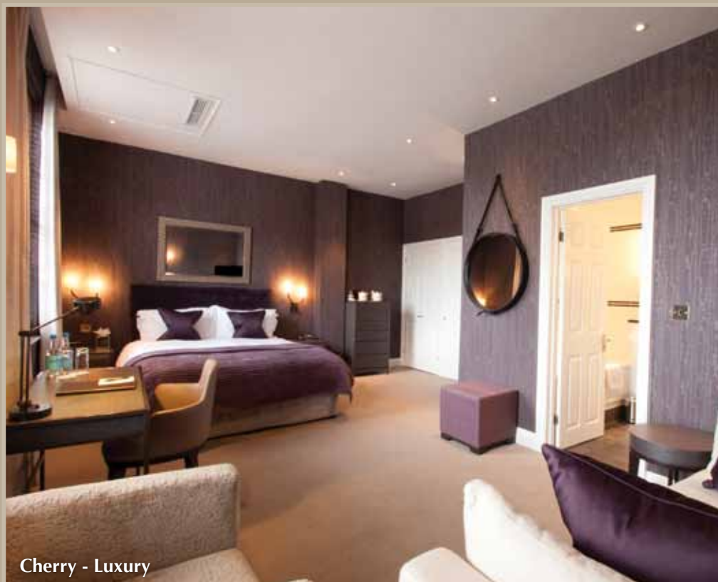
Cherry - Luxury