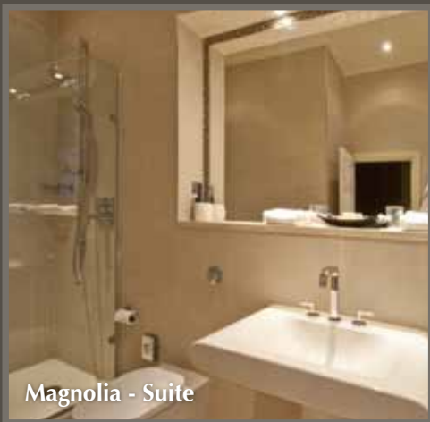
Magnolia - Suite