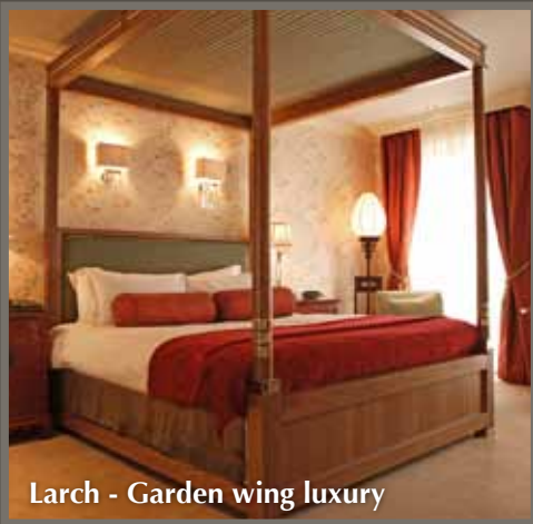
Larch - Garden wing luxury