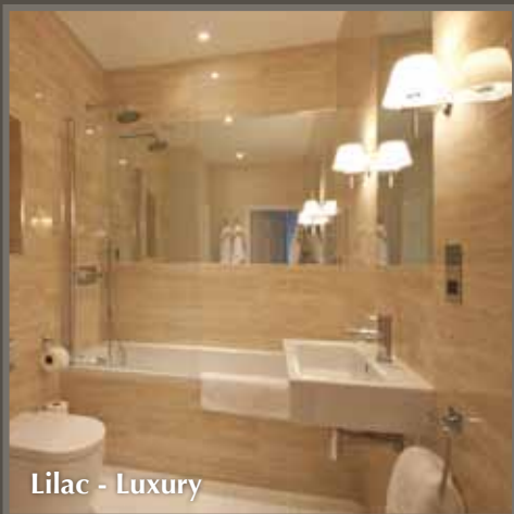
Lilac - Luxury