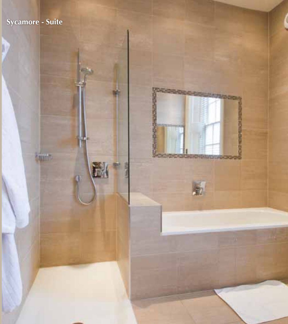
Sycamore - Suite