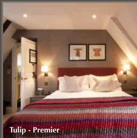
Tulip - Premier