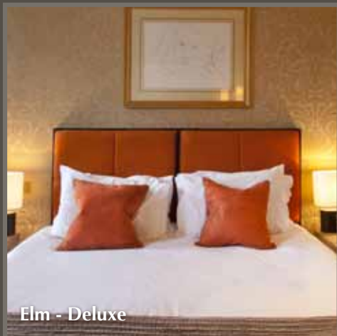
Elm - Deluxe